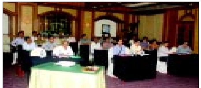
View of Audience