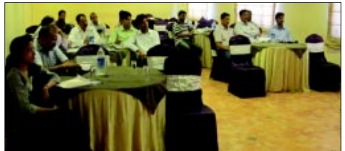
View of Participants in during Seminar organized by WIRC on Important Aspects of Cost Audit & Cost Compliance Certificate at Hotel Adityaz, Gwalior