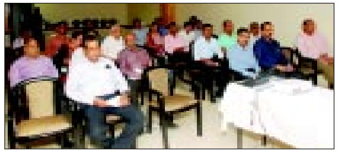
View of Faculty members during Faculty meet held on 1st June 2013 at Mumbai