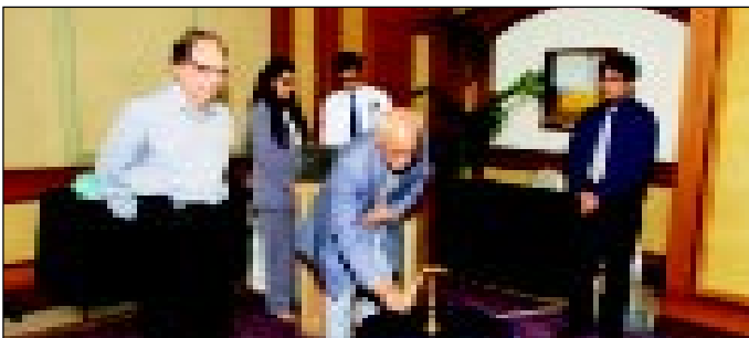
CMA M.K. Narayanswamy inaugurating the seminar by lighting the lamp.