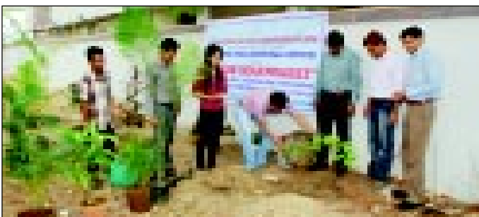
Celebration of Institute's Foundation Day : Green India Project : planting of saplings on 19th May 2013 at Proposed CMA Bhavan, CBD Belapur, Navi Mumbai.