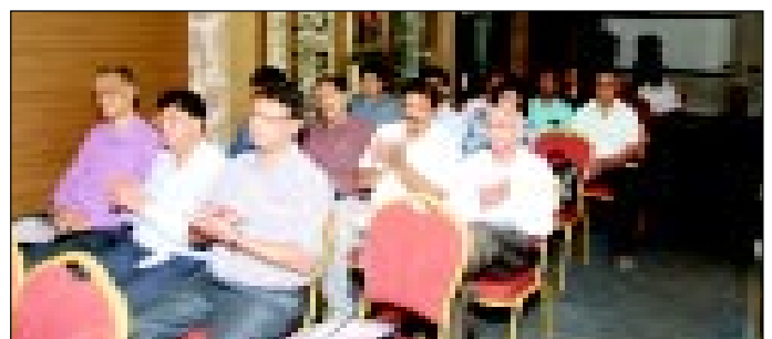
View of members during Seminar on "Provisions and Applicability of Cost Audit and Cost Compliance" jointly organized by WIRC & Kalyan-Ambarnath Chapter on 11th May 2013.