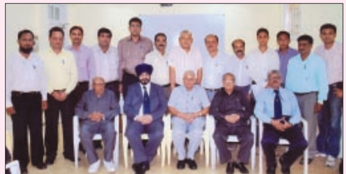
View of Participants during first CAT ROCC Meet held at WIRC on 21st June 2010.