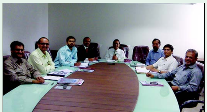
EC meeting of WIRC held in the Committee Room of New Premises of Ahmedabad Chapter