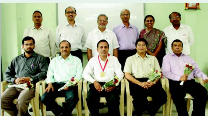
New Office Bearers of WIRC for the term 2011-12