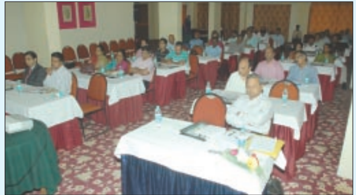
View of Participants during the Seminar on New Mechanism of Cost Audit and Cost Records held on 17th February 2012 at Hotel Parle International, Mumbai