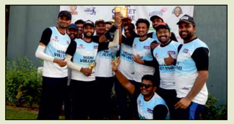
Winner Team of CMA Cricket League 2021 organised by Ahmedabad Chapter.