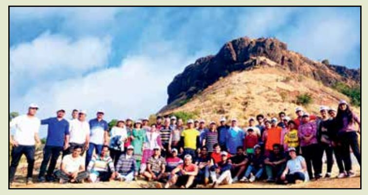
View of Participants