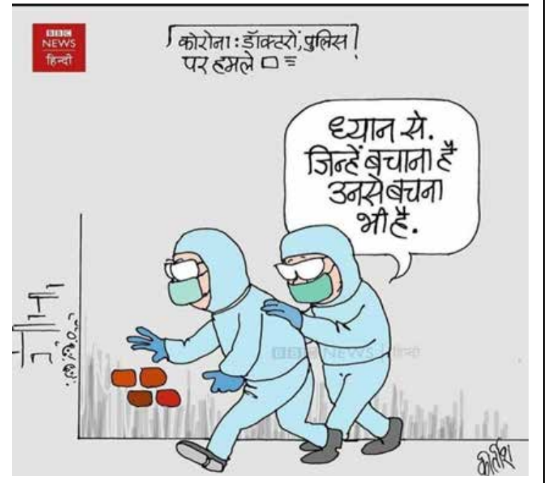
Photograph 2 – Service during Pandemic

8. Emergency Services - Services offered in certain critical condition or unique situation. Like earth quake, Flood, Fire, Pandemic etc. These services are offered by Govt. or Society as charity. Like NDRF services, Fire tender services, Free Langers during natural calamities etc.