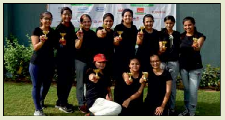
Women's CMA Cricket Team - Ahmedabad Chapter