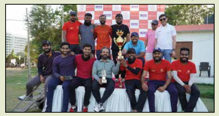
CMA Cricket Tournament 2021 organised by Baroda Chapter