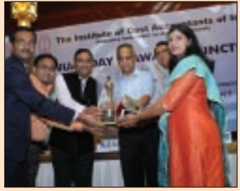
Category: Public Manufacturing (Large) Security Printing & Minting Corporation of India Limited - Third