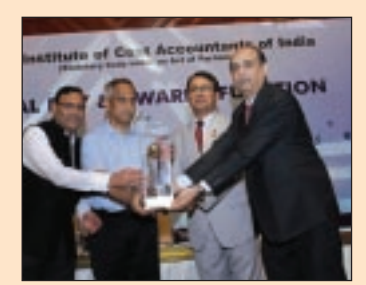
Category: Private -Manufacturing (Large) Third - Cadila Healthcare Ltd.