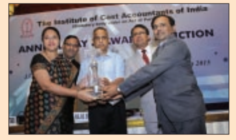
Category: Public -Service Sector (Large) Dakshin Gujarat Vij Company Limited - Second