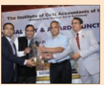
Category: Private -Manufacturing (Large) ACC Limited -Good Performance