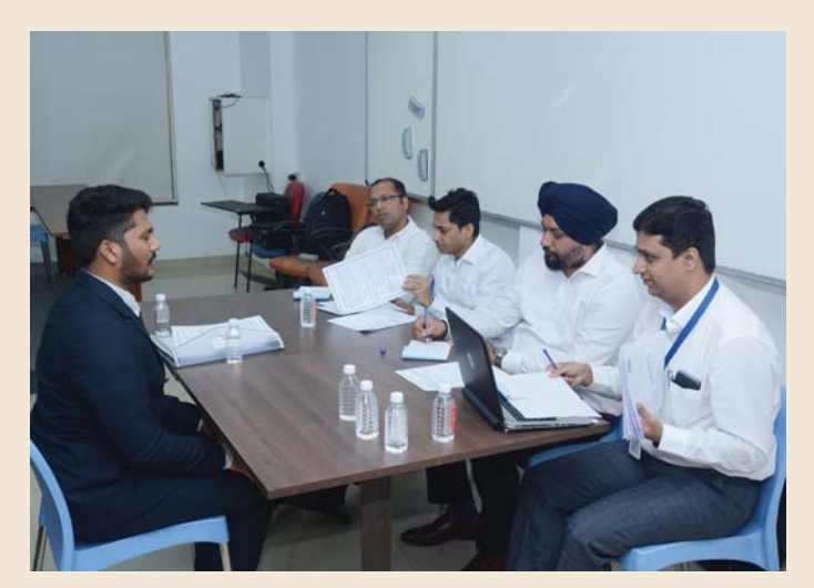
Hathway Cable & Datacom Ltd & DEN Networks Limited - Reliance Group Company