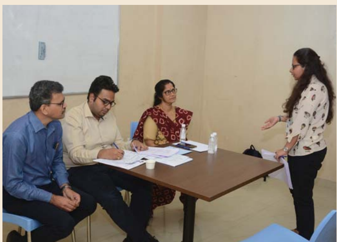
Galaxy Surfactants Limited