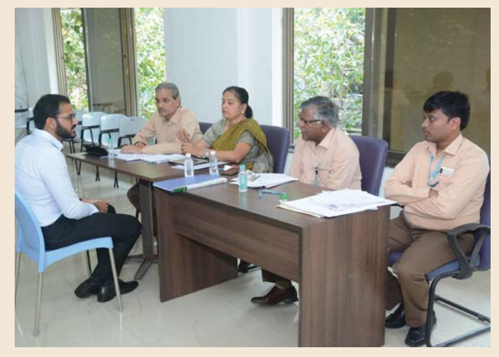
Bharat Electronics Ltd.