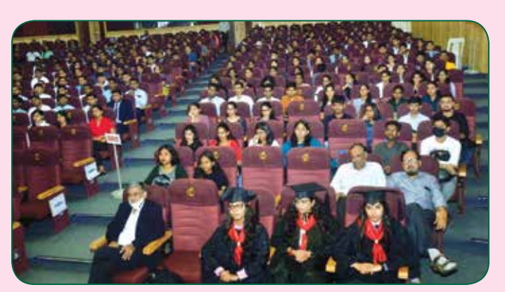
View of Students