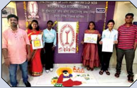
Drawing and Rangoli Competition Organised by WIRC on 22nd January 2024 on the occasion of Ram Mandir Pran Prathishta Mahotsav.