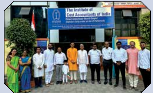
Flag Hosting - Pimpri Chinchwad Akurdi Chapter