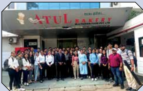
Industry Visit at Atul Bakery organised by Surat South Gujarat Chapter