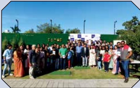
View of members during "Family Reunion organised by Indore-Dewas Chapter on 16th January 2024.