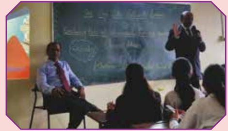
Navi Mumbai Chapter