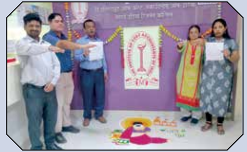
WIRC staff taking pledge on 'National Voters Day' on 25th January 2024