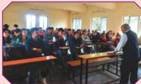
Vapi Daman Silvassa Chapter