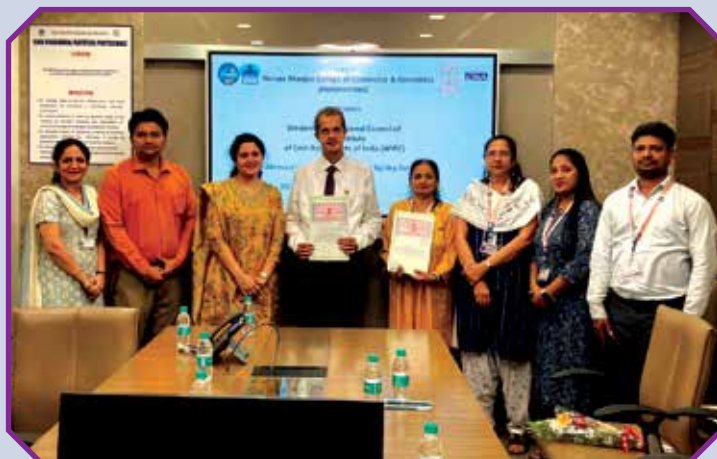
ICMAI of WIRC Sign MOU with Narsee Monjee College, Mumbai for Oral Coaching Classes on 7th February 2024