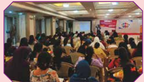
Saraf College, Mumbai