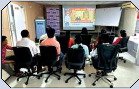
Live Streaming of Ram Mandir Pran Prathishta Mahotsav organised by WIRC on 22nd January 2024.