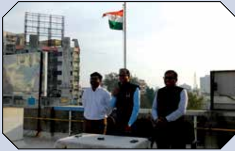
Flag Hosting - Ahmedabad Chapter