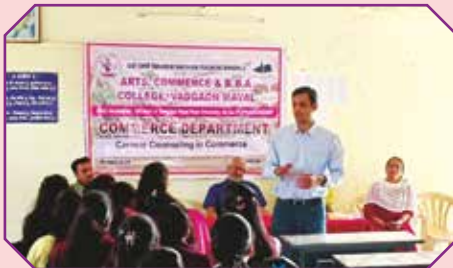
Pimpri Chinchwad Akurdi Chapter