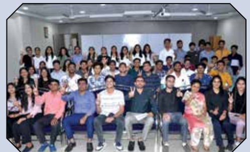
Press Meet organised by Surat South Gujarat Chapter on 12th January 2024.