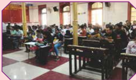
Siddharth College Mumbai