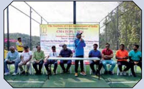
Shri Nitin Bagate (IPS) Dy. Commissioner of Police addressing during Turf Cricket Premier League organized by Aurangabad Chapter.