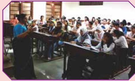
K J Somaiya College, Mumbai