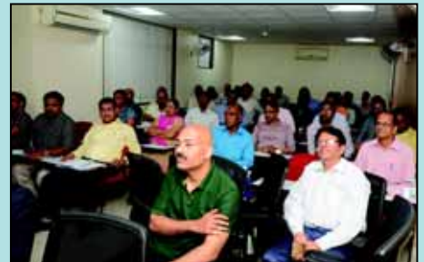
View of audience