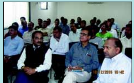
View of audience during CEP organized by WIRC on 10th December 2016.