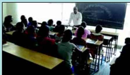
Career Counselling lecture arranged by WIRC at K B. College of Arts and Commerce,