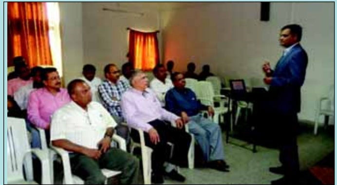
CMA Satish Rathi interacting with participants during CEP on Introduction of Dry Port & Opportunities for Entrepreneurs organized by Aurangabad Chapter