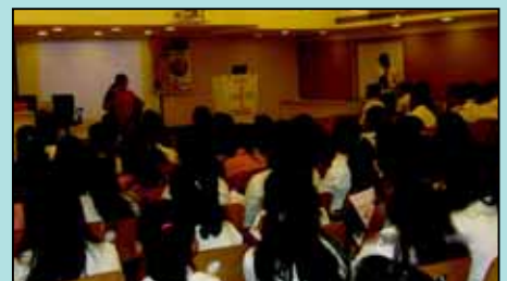
Career Counselling lecture arranged by WIRC at Mehta College of Commerce, Airoli, Navi Mumbai