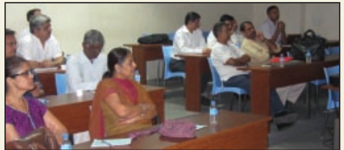
View of Participants during CEP on CSAR organised by WIRC on 27th September at Shah Management Institute, Ghatkopar