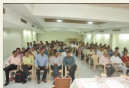
View of Participants