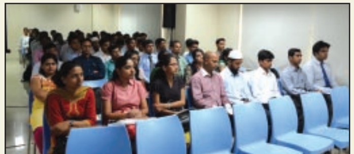
View of Students during Campus Interview organised by Institute on 19th & 20th September 2014 at A. M. Shah Management Institute, Ghatkopar