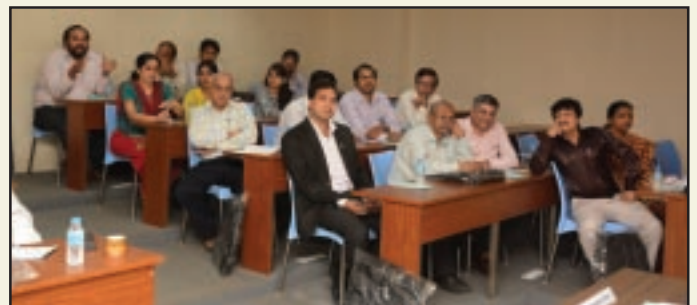
View of Faculty members during Faculty Meeting organised by WIRC on 19th September 2014.