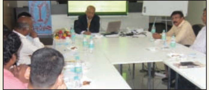
View of Participants - IFRS Training programme