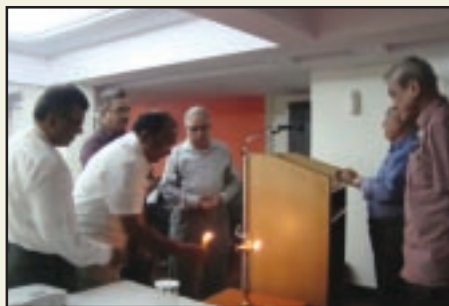
Dignitaries lighting the lamp as the seminar on Practical Aspects of Excise and servicetax organised by Vapi Daman Silvassa chapter on 11/9/14 at Silvassa.