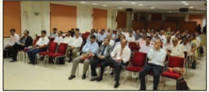
View of Participants during Corporate Cost Management week held at Mumbai on 10/9/2014.