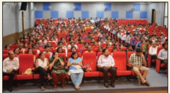
View of students during Felicitation Function