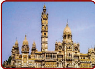
Laxmi Vilas Palace

The city has witnessed the rise and fall of several kingdoms and empires, Hindus, Pathans, Moghuls and Marathas and now occupies a vibrant position in the industrial and educational map.