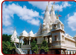
BAPS Shri Swaminarayan Mandir