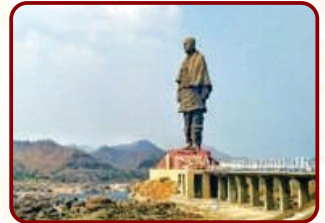
Statue of Unity