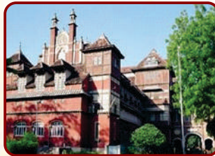
Museum & Pictures Gallery