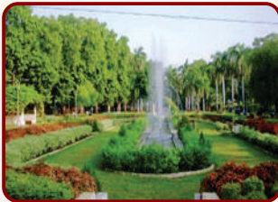
Sayaji Baug Zoo